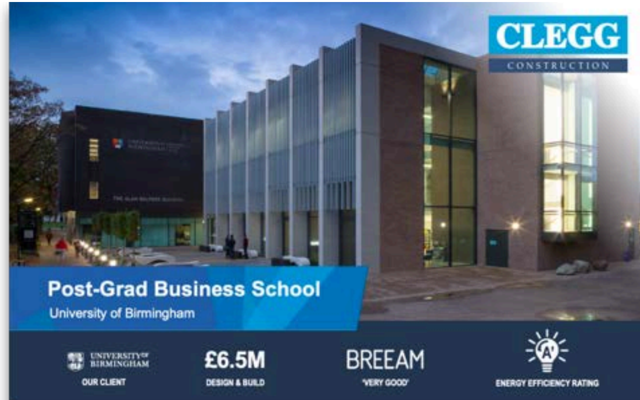
Post-Grad Business School University of Birmingham