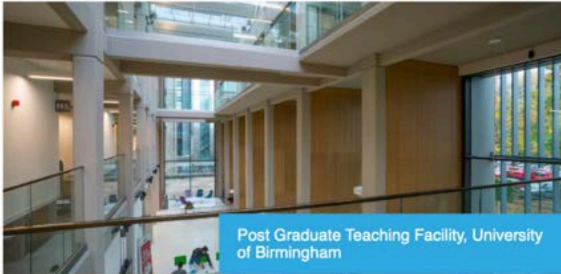
Post Graduate Teaching Facility, University of Birmingham